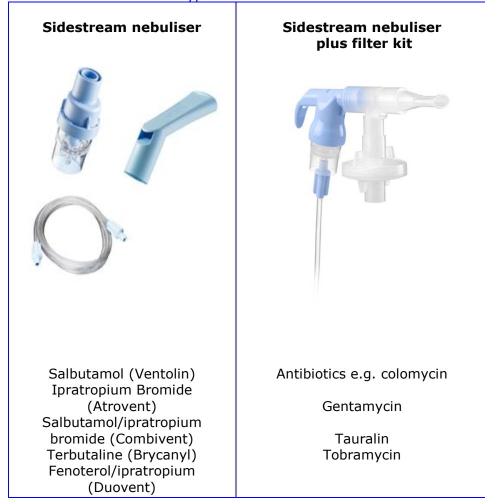
Table 1: Nebuliser types and their associated medicine.

For VENTSTREAM users only: Replace the nebuliser filter after each use.